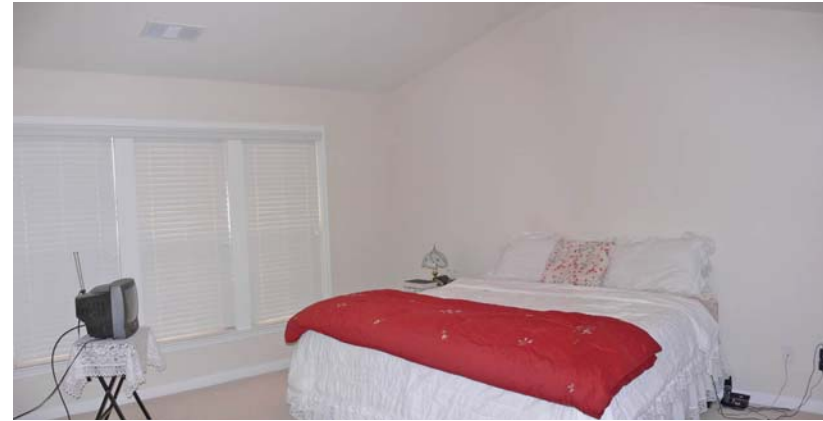
Spacious Master with Vaulted Ceiling